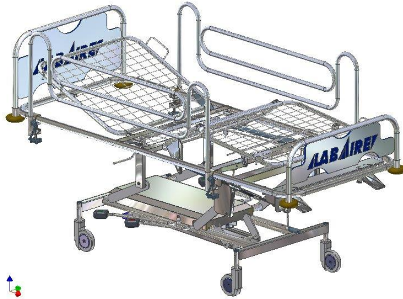
Four Section Bed